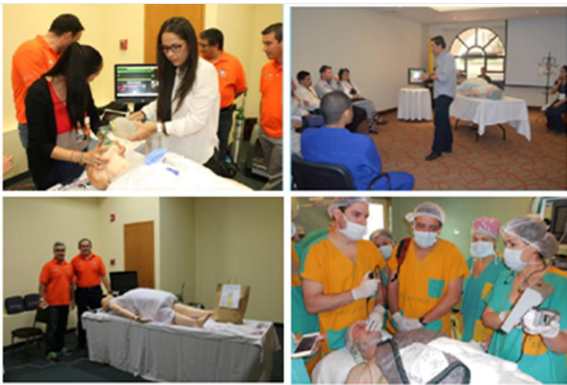
Simulation and Hospital Workshops