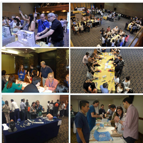
Hands on Workshop