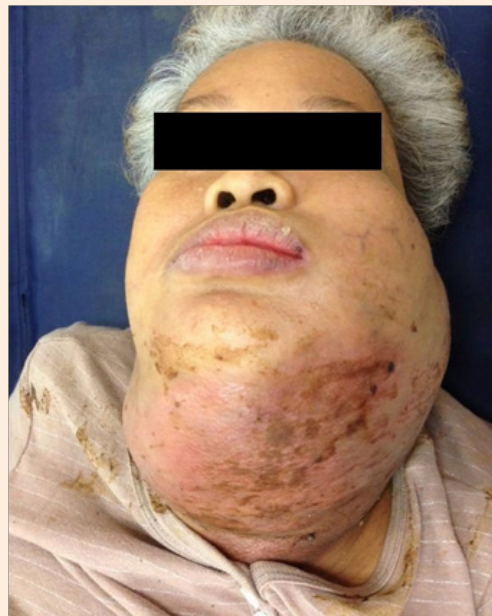
Figure 3: Patient during Second Admission.

Six weeks later she came in again with shortness of breath and a worsening dysphagia. The neck swelling has become larger (20 x 15cm), extending to the left infra-orbital and right submandibular regions. She appeared lethargic and tachypnoeic. She could not talk, responding to questions by head and hand gestures only. After stabilisation, an urgent nasal endoscopy was done. The epiglottis was oedematous, but the vocal cords could not be visualised. In view of the compromised airway and respiratory distress, we decided for endotracheal intubation (Figure 3).