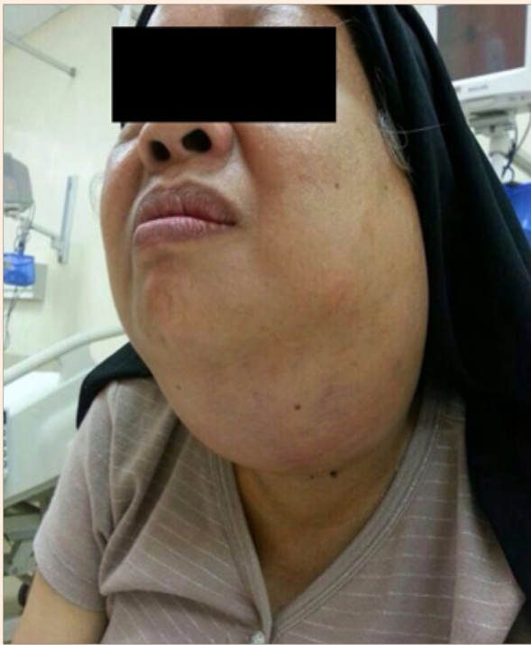
Figure 1: Patient during First Admission.

She was breathing comfortably without stridor or wheeze. The neck swelling measured 10x10cm, extending from the left submandibular region to the anterior midline, displacing the trachea towards the right side. It was firm, erythematous, tender and non-fluctuant. Her mouth opening was restricted with an inter-incisor distance of 2cm only. The floor of her mouth was raised on the left side, with pus discharging from the left buccal sulcus. The oropharynx could not be visualised, Mallampati score IV. Her full blood count revealed a total white count of 11.7 \times 10^3/\mu\text{L} (81% granulocytes), haemoglobin of 14.4 g/dL and platelet count of 201 \times 10^3/\mu\text{L} (Figure 1).