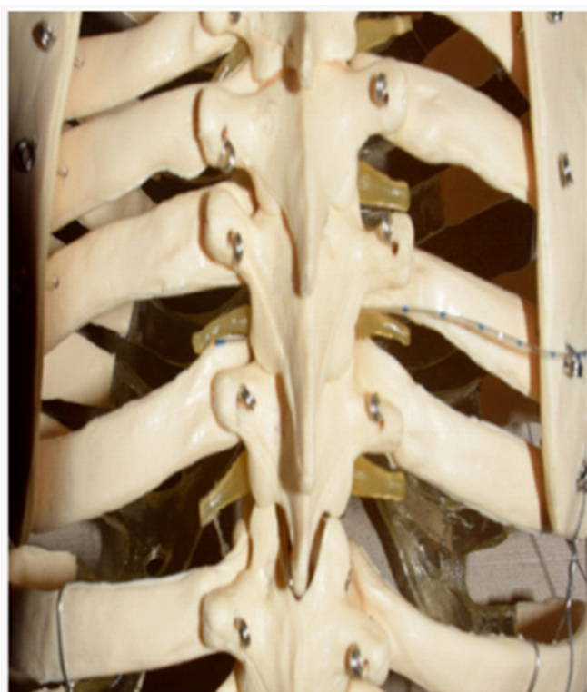
Figure 1 Paravertebral catheter reached contralateral paravertebral space via intervertebral foramina.

Our patient did not develop Horner's syndrome after initial paravertebral injection. The initial needle position and ropivacaine may have been posterior to the endothoracic fascia. This fascia is very thin in dissected cadavers and can be perforated by the catheter. 2 The PVBC can reach the contralateral paravertebral space the intervertebral foramina (Figure 1) or prevertebral space (Figure 2). In our case, Horner's syndrome developed after an appropriate infusion rate. We believe the catheter traveled anterior to the endothoracic fascia, into the anterior contralateral paravertebral space.