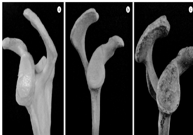
Figure 3 Picture showing types of acromion: A) Type I acromion- flat B) Type II acromion- curved and C) Type III acromion-hooked.

The three types of acromion based on shape were classified by observation in to; type I (flat), type II (curved) and type III (hooked) (Figure 3). Data obtained were analyzed using SPSS version 19.0 and results were presented in tables and descriptive statistics like percentage mean and standard deviation and student t-test and z-test were used.