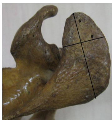
Figure 1 (A) Measurement of the length of the acromion L and (B) Breadth of the acromion B.