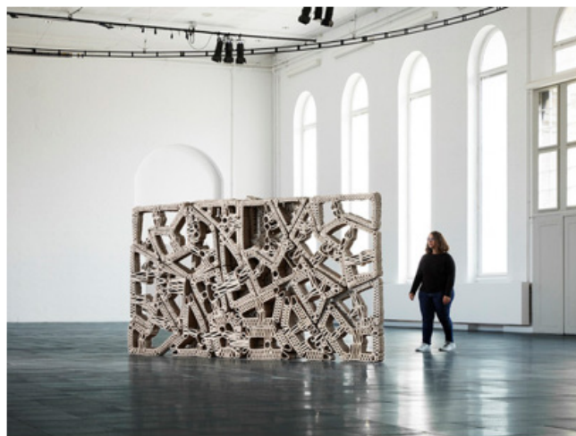
Figure 6 Cellulose wall demonstrator.

Although the MIT Responsive Environments Lab doesn't exclusively design entire buildings, it does focus on developing sensory, interactive, and adaptive technologies that transform architectural spaces into smart, responsive environments. However, several of its projects have been implemented or tested in real or speculative architectural contexts.