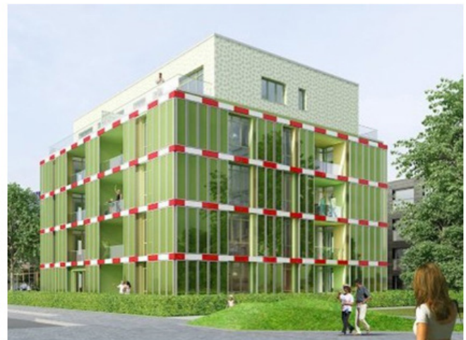
Figure 3 BIQ Building, Hamburg (Germany).

The facade is a microalgae bioreactor, part of an integrated renewable energy concept. It's a “smart” facade that produces heat and electricity from the microalgae grown in the bioreactors. Periodically this microalgae biomass is collected through filters and sent to an external plant where it is fermented to generate biogas that is used in the generation of electricity outside the building (Figure 4).