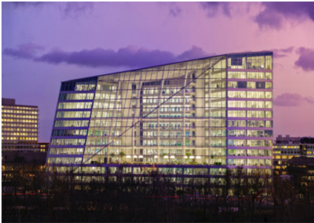
Figure 1 The Edge.

It constitutes an architecture that thinks in terms of a network, as a social and thermal ecosystem. It is characterized by being a smart architecture with IoT sensors that regulate light, temperature, occupancy, and energy. It has AI algorithms that optimize the use of space based on human behavior data. Although it may not be explicitly biomimetic, its operation reflects principles of ecological efficiency and environmental adaptation (Figures 1 & 2).