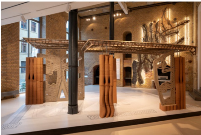
Figure 5 Living architecture.