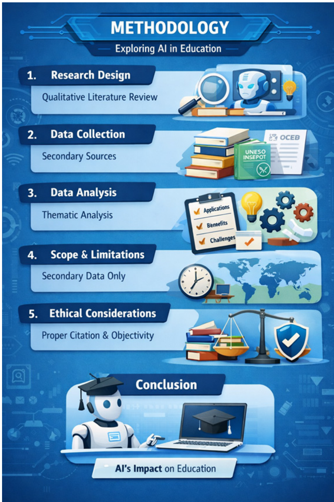
Figure 3 Methodology framework for exploring the role of AI in education.