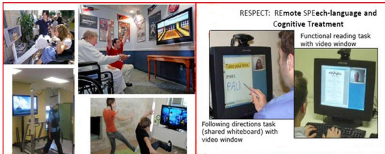
Figure 4 Sample TR clinical implications.

consisted of a Web-based library of status tests, therapy games, and progress charts, and could be used with a variety of input devices, including a low-cost force-feedback joystick capable of assisting or resisting in movement. Data from home-based usage by a chronic stroke subjects demonstrated the feasibility of using the system to direct a therapy program. The system mechanically assisted in movement, and was able to track improvements in movement ability. 13