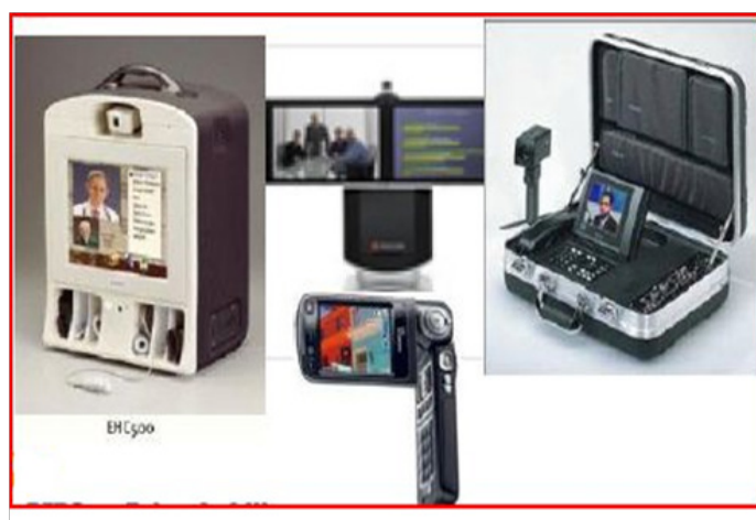
Figure 3 Examples of devices used in TR.