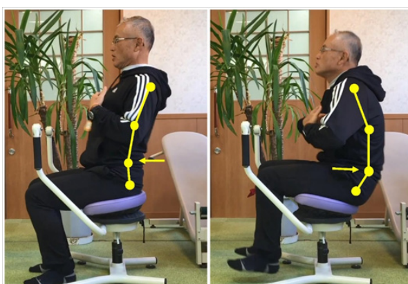
Figure 2 Side view of the practice for the flexibility of chest-lumbar region by Murakami.

There appear to be four necessary factors to this movement. They are 1) there is an overall flexibility of the neck, chest, lumbar and pelvic lines, 10 2) this range has a somewhat wide range of motion, 3) this movement is smooth and interlocking 16 and 4) there is an increased agility of the movement in rather wider flexible region. 17 When these 4 factors can work together, an athlete can run fast smoothly without injuries.