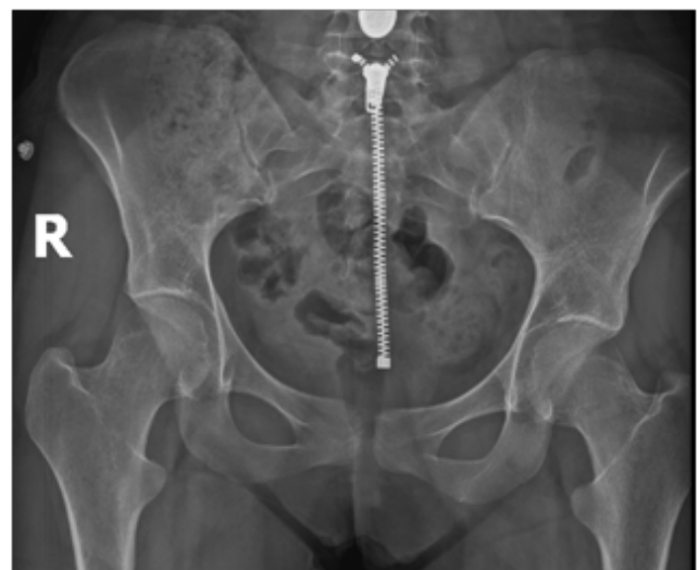
Figure 1 Pelvic AP X-Ray which shows no signs of fracture.

showed no sign of improvement. Later on, a hip MRI (Figure 2) showed a left femoral neck fracture. Laboratory testing included a complete blood cell count, a chemistry panel, serum 25-hydroxyvitamin D levels, parathyroid hormone levels, and thyroid-stimulating hormone with reflex thyroxine levels. Lab results showed nothing abnormal with all values within the range. A consultation from the orthopedics department recommended surgery but the patient refused and she stopped coming to the clinic for further treatment.