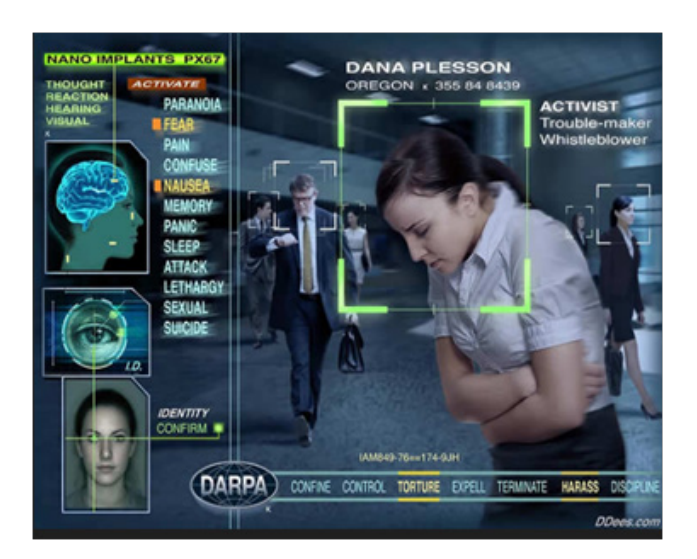
Figure 2 Brain nanobot: Surveillance and mind torture

Brain nanobot can be used to perform a permanent surveillance and torture a person by wifi