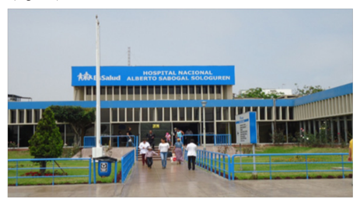
Figure 4 ESSALUD: Peruvian hospital network where nanomafias would operate.

that their members do not know nanomafias, surprisingly "CUT" an health union has not denounced illicit nanotechnology (Figure 4) (Figure 5).