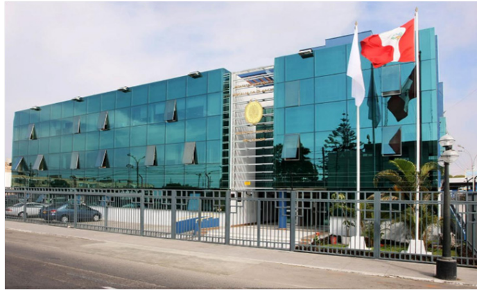
Figure 6 Mafias of Prosecutors: Key element of nanomafias.

It is necessary to emphasize that the criminal activity of this nanomafia, "the ghost mafia", "the wifi mafia", must be known by the society in all areas because it can affect any society sector and for the power of its weapons like the Brain net. The magnitude of this mafia can only be compared to that of drug trafficking. There actually are many similarities between the drug trafficking and this "nanotrafficking" organized by nanomafias, although the main crime element is different, in the former it is the coca leaf and in the latter it is the brain nanobot, both can damage the mental health, both are billionaries industries that infiltrate and corrupt all the institutions, however, unlike the drug trafficking that is reported by mass media in its headlines, in the nanotrafficking the press is its main member and for that reason it hides it, and it remains unknown to most of society that even considers it fiction due to the own press disinformation campaign that presents the crime as fiction.