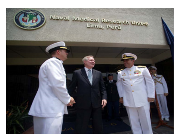
Figure 3 The US Navy: Main suspect of organizing nanomafias in Latin