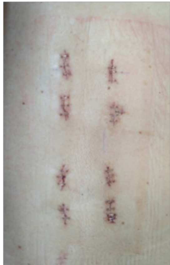
Figure 1 Postoperative incisions image after percutaneous fixation.

Wang considered PF as a good therapeutic option in type A thoracolumbar fractures, with significant differences between this technique and traditional open surgery, regarding incision size (Figure 1) blood loss, surgical time, hospitalization period, need for blood transfusion and postoperative analgesia. However, there were no differences between these two techniques regarding the radiological results obtained (Figure 2-6). 13