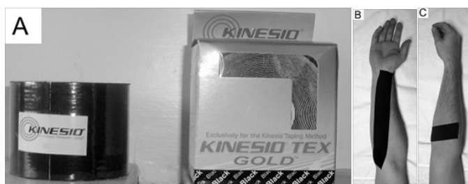
Figure 2 Kinesio taping applied in the present investigation and application modes. Panel A) type of bandage used; Panel B) Kinesio taping group; Panel C) placebo bandage group.

Data collection: To data collection, the visits were previously scheduled and the athletes should be at rest for, at least, 24h from their last training session. First, the demographic data were collected, which were registered in a specific form.