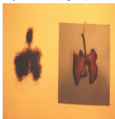
Figure 1 In this picture, we show the respiratory structures of the fetus (blue arrow) and the isotopic activity obtained in the gammagraphic evaluation (Green arrow). This last picture is equal so the anatomy of the fetal lungs meaning that the surfactant with the Tc 99 reached the fetal lungs.

An alternative, in which our group has been working, is in the administration intra amniotic of surfactant in cases of preterm labor that does not give time enough for the administration of corticosteroids. First of all, the experience was conducted in guinea pigs to determine if indeed the surfactant administered intra-amniotic reached the fetal lungs, this was duly substantiated (Figure 1). 64