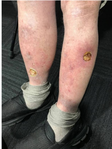
Figure 1 Radiation-induced ulcers on the lower legs following radiotherapy for non-melanoma skin cancers.