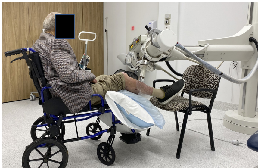
Figure 3 Leg treatment showing ease of set up with Xstrahl SXRT machine. Wheelchair bound patient having SXRT treatment to lesion on right lower leg. Ease of set up enables quick treatment without need for transfers from the chair to bed, minimising discomfort for patients and making workflow smooth and more efficient.