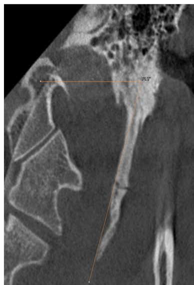
Figure 6 Shows Mediolateral angulation (MLA).

All data collected was recorded and tabulated in Microsoft Excel sheet and SPSS 20.0 for windows was used for statistical analysis. The length and angulations were recorded separately for the left and the right side. Pearson's correlation coefficient was used to test possible associations between the length of SP and angulations. A p-value <0.05 was considered to be statistically significant (Figure 7).