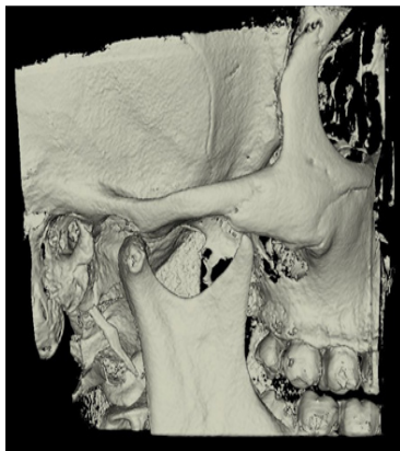
Figure 1 Shows single segment ossification.

The morphology of SHC was recorded to evaluate the general structural appearance and the number of segments and was categorized into 3 types as single segment ossification, two segment ossification and three segment ossification (Figures 1–3). The length was defined as the distance between the base of the SP and the tip of the ossified SHC. If there was segmental ossification of the SP, the distance was measured including the non-ossified parts (Figure 4). The antero posterior angle (APA) was defined as the angle made by the process with the perpendicular dropped from the lateral part of the external auditory meatus (Figure 5). The mediolateral angulation (MLA) was defined angle of intersection between the longitudinal axis of the SHC to the perpendicular dropped from the base of the process (Figure 6).