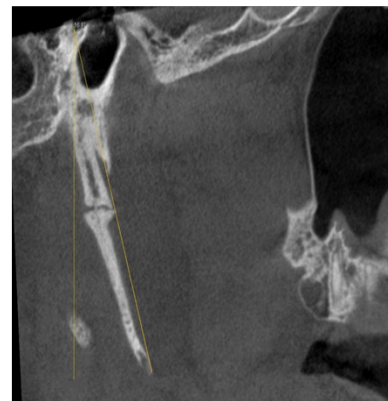
Figure 5 Shows measurement of Antero posterior angulation (APA).