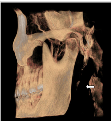
Figure 3 Shows three segment ossification.