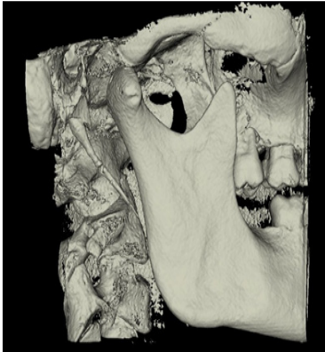
Figure 2 Shows two segment ossification.