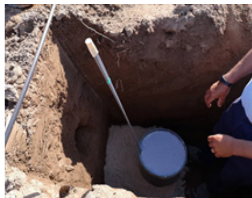
Figure 1 Installation of lysimeter aboveground for leachate collection.

In order to monitor the nutritional and microbiological composition of the leachates, in the different treatments, a network of lysimeters was installed (Figure 1) at a depth of 2m. The cattle slurry used on the experiment was chemically analysed each year (2019 and 2020), for N, in order to estimate the amounts to be applied in each treatment, to respect the amounts choose to be tested, as well as for the main characteristics, considered in the EU legislation (Table 1), and the values determined were all within the limits allowed for its use in agricultural soils. Increasing rates of slurry were applied, for continuous bands (the blocks), maintaining blocks that were not submitted to the treatment (T0), in order to evaluate the effect of treatments on the various parameters under evaluation. Thus, in the field, the following treatments were performed: T0 - without slurry application; T1 - quantity of slurry, in order to supply 85 kg of N ha -1 ; T2 - quantity of slurry, in order to provide 170 kg of N ha -1 ; T3 - quantity of slurry, in order to supply 340 kg of N ha -1 , both with and without inoculation.