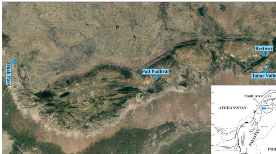
Figure 1 Base map of the study area showing sampling location (modified from Google map).