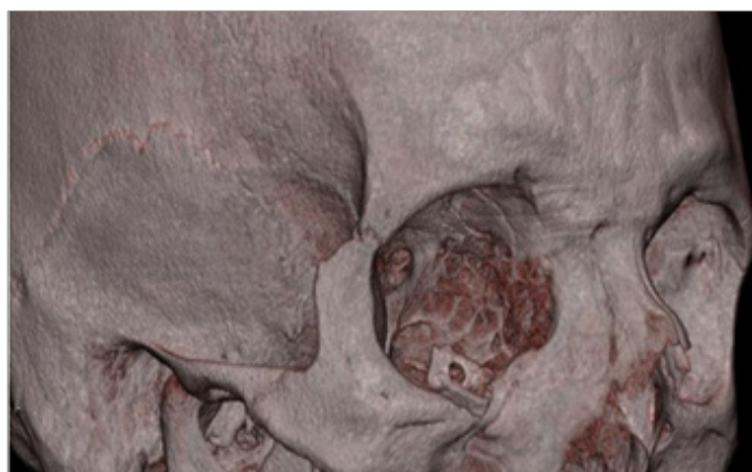
Figure 3 OOKP plate implant in the subcutaneous pocket below the right lower eyelid.