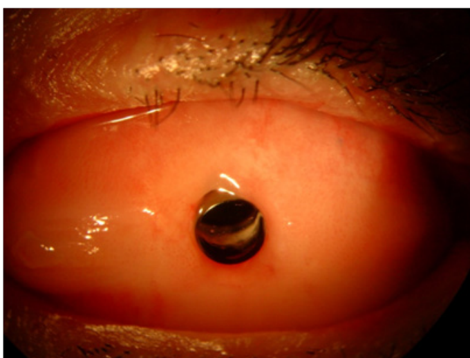
Figure 4 Modified Osteo-Odonto-Keratoprosthesis (MOOKP) Surgery.