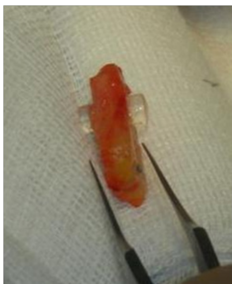
Figure 2 Lens implant in osteo-odonto keratoprosthesis plate.