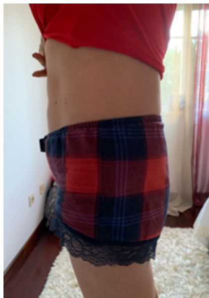
Figure 2 Profile study patient.

associated with increased activity of the rectus abdominis muscle, decreased activity of the internal oblique abdominal muscle and decreased activity of the iliopsoas and gluteus maximus muscles in the hip joint. The leaning back posture reduces the contraction of skeletal muscles, thus applying stress to the skeletal system, which is a factor unrelated to contraction and leads to an increase in the stress applied to the lumbar region. Backward leaning is a specific type of poor posture that often causes back pain. People who have a backward leaning posture have exaggerated curves in the spine, hips tilted forward and the appearance of leaning back when standing. 10