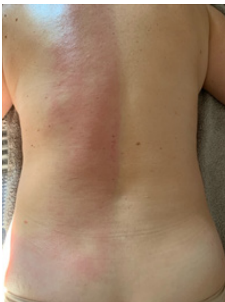
Figure 8 Study patient - left side.