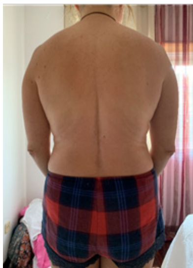
Figure 1 Patient in the study.

An anamnesis was taken of the patient’s medical follow-up and the respective medical examinations carried out previously. A physical examination was then carried out with images recorded using the mobile phone’s camera (Figure 1) and the muscle tone of the region to be treated was assessed by palpating the pelvic muscles during all the sessions.