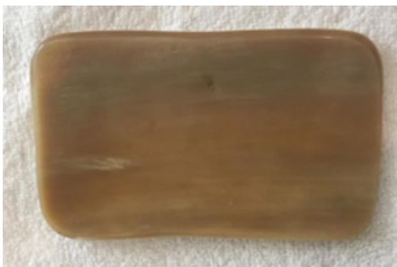
Figure 4 Gua Sha applied in the study.

The patient then underwent a treatment program consisting of one 40-minute session a week, with a 6-day break between sessions, for approximately 4 months, for a total of 15 sessions. In each session, the 40 minutes were divided between both sides of the spine, regardless of the presence of contractures or myoarticular problems, with moderate to strong pressure applied, however the patient's reaction was mild. The sessions consisted of unidirectional scraping applied with a Gua Sha made from buffalo horn (Figure 4) and a specific oil of Chinese origin (Figure 5), whose function is to help warm up and increase local microcirculation.