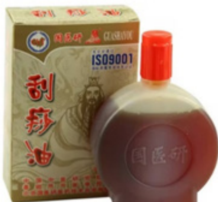
Figure 5 Oil Used in the study.