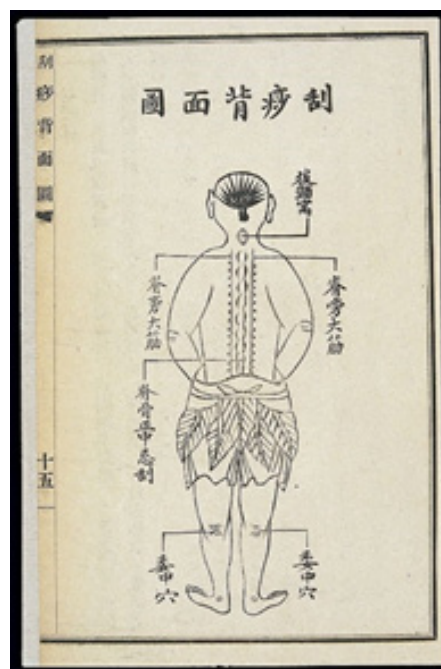
Figure 6 Bladder meridian.

Another objective was to increase tissue microperfusion, bringing anti-inflammatory cells to the site of the greatest incidence of pain and metabolic toxins; to try to increase the level of pro-inflammatory cytokines and decrease the level of immunosuppressive cytokines; and finally, to tonify the Kidney meridian by scraping over the Shen Shu point (Bladder 23). 2,4,8