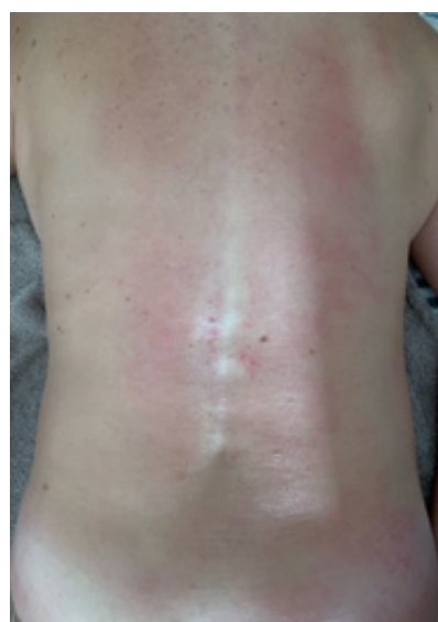
Figure 7 Study patient - after gua sha both sides.

The results showed improvements in the reduction of pain, especially where it was most prevalent, and a greater range of movement in the patient's spine. It is also important to note that the patient was free of back pain for 2 to 3 days and had a feeling of freedom in the muscles that make up the lumbar region. The photographic images corresponding to Figures 7 and 8 show the back after the session and the patient's reaction on each side of the spine. Regarding muscle tone, there was no change since this type of treatment does not serve to strengthen muscles, but there was an obvious increase in muscle relaxation.