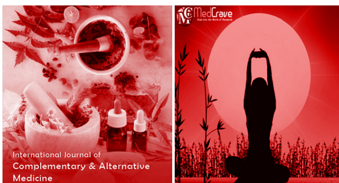
Figure 4 International Journal of Complementary and Alternative Medicine Peer Reviewed Open Access Articles and Research Available to Consumers.

“A complete listing of “CAM” methods would be a monumental task”. 2 Some of the most recognized CAM therapeutic approaches include but are not limited to mind-body medicine (Yoga Therapy, Tai Chi, Pilates, Meditation), acupuncture, quantum healing, massage therapy, animal-assisted therapy, nutritional supplements, detoxification, biofeedback, neuro feedback, evidence based self-care, chiropractic care, vitalism, Chinese medicine, homeopathy, naturopathy, spiritual healing, ritual healing, clinical and applied hypnosis, guided imagery, herbal medicines, aromatherapy, touch therapy, energy therapy, art therapy, music therapy, and rhythmic auditory stimulation (Figure 4). 2,4