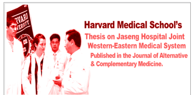
Figure 2 Harvard Medical School's Thesis Supporting Integrative Medicine at Jaseng Hospital - Published in The Journal of Alternative and Complementary Medicine.

movement as a group of diverse medical and health care systems, practices, and products that are not yet considered to be part of traditional medicine. 2 Complementary medicine is used in conjunction with conventional medicine, and alternative medicine is sometimes used in place of traditional western medicine. CAM treatments are often used in addition to and integrated with traditional medical treatments.