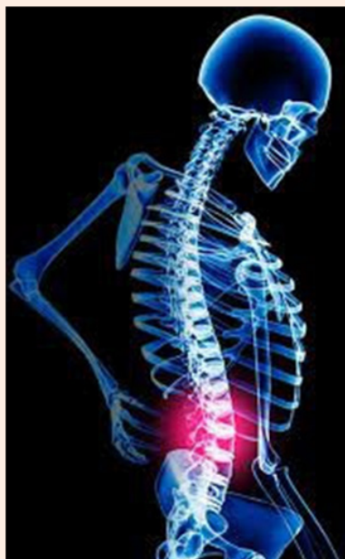
Figure 1: Chronic inflammation and degeneration of the joints and organs.

Men and women with rheumatoid arthritis have a high prevalence of preclinical atherosclerosis independent of traditional risk factors, suggesting that chronic acidic inflammation and, possibly, disease severity are atherogenic in this population [3]. Regarding this matter an editorial published at Circulation Journal in 1999 have discussed about the many similarities shared by rheumatoid and atherosclerosis [4]. Researchers have found that the atherosclerotic process begins very early in the course of rheumatoid arthritis with the study revealing a significant increase in intima-media thickness, an indicator of atherosclerosis, in just 18 months [5]. Other scientists have found a rapid increase in myocardial infarction risk following diagnosis of rheumatoid arthritis amongst patients diagnosed between 1995 and 2006 [6].