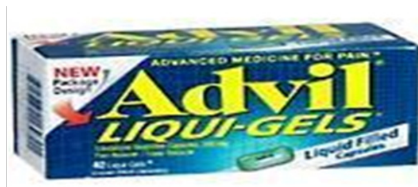
Figure 2 commercial packaging for Ibuprofen (Advi) I.