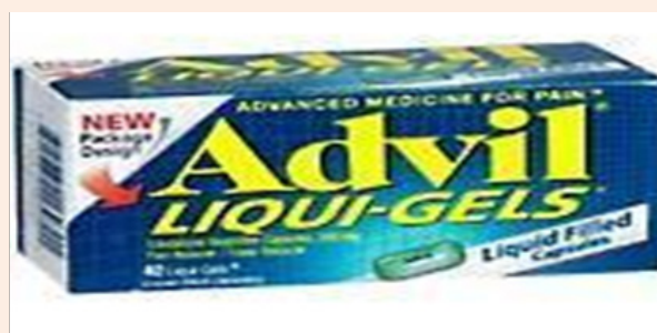
Figure 2: commercial packaging for Ibuprofen (Advil) 1.