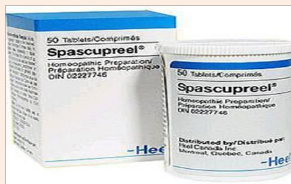
Figure 3: commercial packaging for Spascupreel.