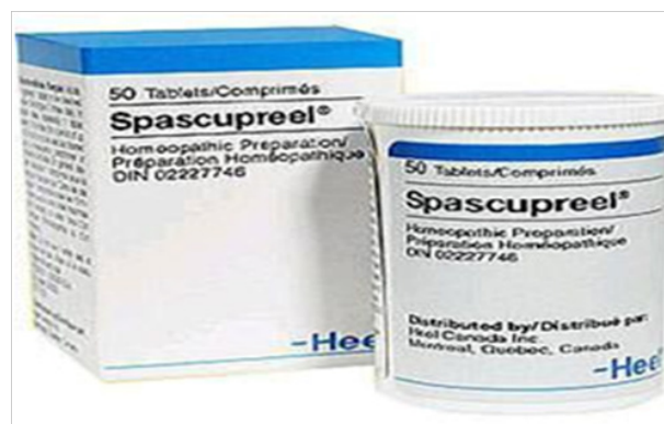
Figure 3 commercial packaging for Spascupreel.