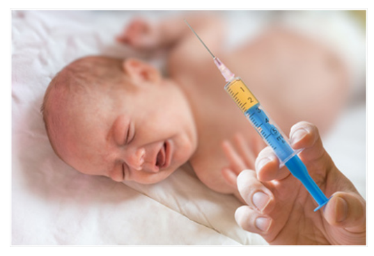
Figure I Homeopathic Drainage for Vaccinated Children.

Among all the vaccinations performed today - the strongest scientific experience about the disease itself and its vaccination results is with DTaP and MMR (Figure 1).