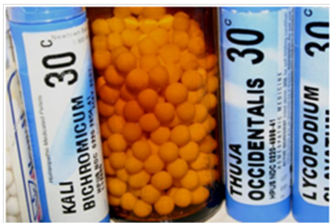
Figure 3 Homeopathic Medications.

Homeopathy is believed to stimulate the body's own healing processes by stimulating different systems including the immune system (Figure 3).