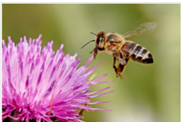
Figure 4 Apis Mellifica.