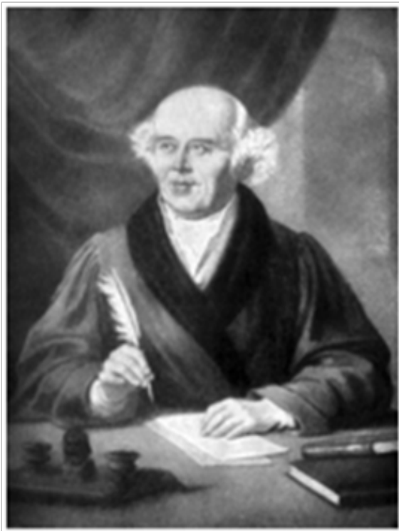
Figure 1 Samuel Hahnemann.

Any innovation in history has started by pushing the limits and thinking outside the box. Samuel Hahnemann (1755-1843) a German Physician, linguist, and the father of Homeopathy noticed that the medical practices of his time were crude and produced more harm than cure. This is the time when ether and chloroform were used as anesthetics in surgical units with lots of side effects, and mercury was used to treat syphilis, with treatment being worse than the disease (Figure 1).