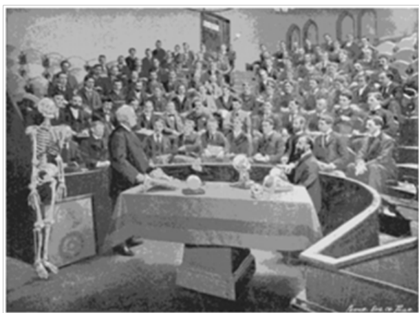
Figure 6 The anatomical amphitheater at Hahnemann Medical School, Philadelphia. The lecture is accompanied by demonstration of museum specimens.