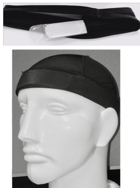
Figure 1 (Top) Impact sensing strip shown partially removed from head band. (Bottom) cap mounted on a mannequin head.

The impact sensing strips reported here (Figure 1) are designed to produce a physical image that is proportional to the magnitude and location of the impact experienced. The strips are designed to produce responses that vary over the relevant range of forces experienced (expressed as g forces). The design is proprietary. 6,7