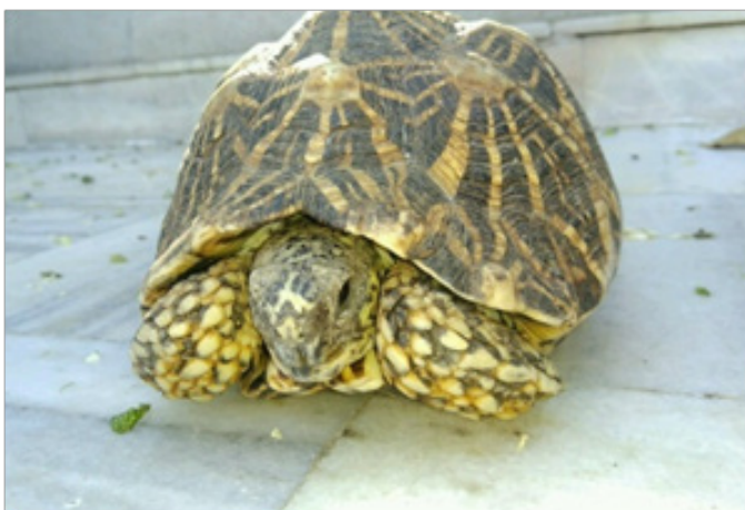
Figure 1 Indian star tortoise.

Approximately two years old two Indian star tortoises ( Geochelone elegans ) were referred with the complaint of the passing of watery faeces, reduced feed intake and dullness for the last six days. Another tortoise in the same captive area was died with the similar complaints. Clinical examination of the tortoises revealed, dullness and passing of watery faeces. Fresh faecal samples were collected from the tortoises (Figure 2) and collected samples were promptly analyzed within 1 hour. Samples were analyzed macroscopically for macro parasites and then microscopically by flotation test. Direct microscopic examination of the faecal samples revealed the presence of Ascarid type of parasitic ova (Figure 3). The tortoises were administered with fenbendazole @ 50mg/kg body weight orally for three days, oral enrofloxacin @ 5mg/kg body weight once in a day and daily twice multivitamin drops for seven days.