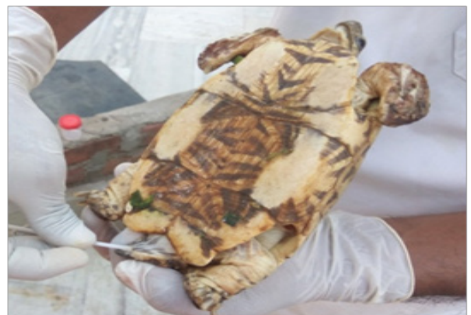
Figure 2 Collection of the faecal samples.