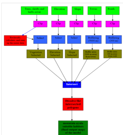
Figure 2 Flowchart of the processes used to build the habitat suitability model for the six localized populations of the mountain nyala in the southeastern highlands of Ethiopia.

Adding a process to dissolve the intersected polygons. As the objective of this study was to identify and map the predicted suitable habitats for the mountain nyala in the southeastern highlands of Ethiopia, this process helps merge all the intersected polygons together using the dissolve tool in the data management. The detailed steps used to construct the habitat suitability model for the mountain nyala were shown in the flowchart (Figure 2).