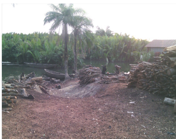
Figure 2 Nypa fruticans encroachment and firewood collection along river banks.

Note: T 1 , T 2 , T 3 and T 4 represents transects 1, 2, 3 and 4