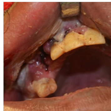
Figure 2 Premolar and vestibular laceration with slough and poor oral hygiene.