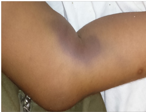
Figure 2 A large ecchymotic patch in the leg of the child.