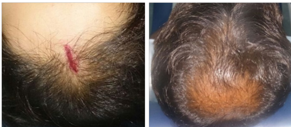
Figure 2 After 3 months.

growth factor (VEGF), epidermal growth factor (EGF), insulin 1-like growth factor, and fibroblast growth factor (FGF). Platelets release large amounts of platelet-derived growth factor (PDGF \alpha , PDGF \beta , and PDGF \gamma ), transforming growth factor beta (TGF \beta_1 and \beta_2 ), EGF, and VEGF 8,10 (Figure 2) (Table 2). The beneficial effects of PRP in AGA thus can be attributed to various platelet-derived growth factors causing improvement in the function of hair follicle and promotion of hair growth. It is safe, cheap, and non-allergic and it appears to be a useful adjuvant in the management of AGA.