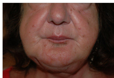
Figure 5 Cosmetic result after intervention (2).