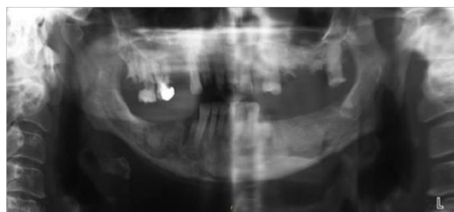
Figure 1 Mandibular osteonecrosis involving both sides of the mandibular symphysis (March 30, 2015).

unchanged but a large abscess had appeared under the chin; a surgical drainage was undertaken; amoxicillin and H 2 O 2 rinses were continued. In October 2015, the situation was unchanged and the same therapy was continued; at the same time the patient was receiving everolimus, in addition to exemestane and extensive aphthosis was successfully treated with low level laser therapy. Because the stage III mandibular Osteonecrosis was still progressing with extensive bone necrosis and multiple external fistulae, in spite of continuing therapy with various antibiotics, the decision to perform a wide resection of the lesions was taken in April 2016, following extensive discussion between the patient, the oncologist and the oral surgeon.