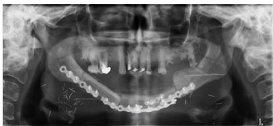
Figure 2 Resected portion of the mandibular bone.

Figure 2 shows the respected portion of the mandibular bone and Figures 3 shows the reconstructed mandible and Figures 4 & 5 the end cosmetic result. At the present time (9 months after the procedure), the patient's metastatic disease is still under control with hormone therapy. After a smooth post-operative course, her maxillary bone is healed and she is being prepared to receive dental implants (Figure 4).