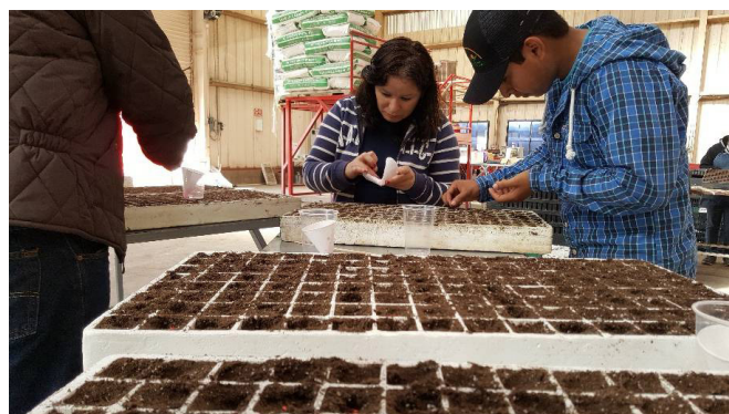
Figure 1 Sowing of seeds in the trays with 130 cavities.