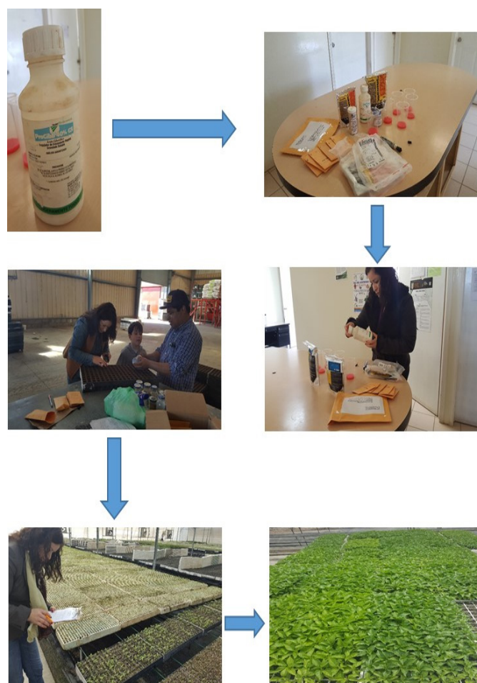
Figure 2 Conditioning, sowing of seeds and seedling development of Habanero chili pepper ( Capsicum chinense Jacq.) in Baja Plants, S.A. de C.V. San Quintín, B. C. January, 2017.