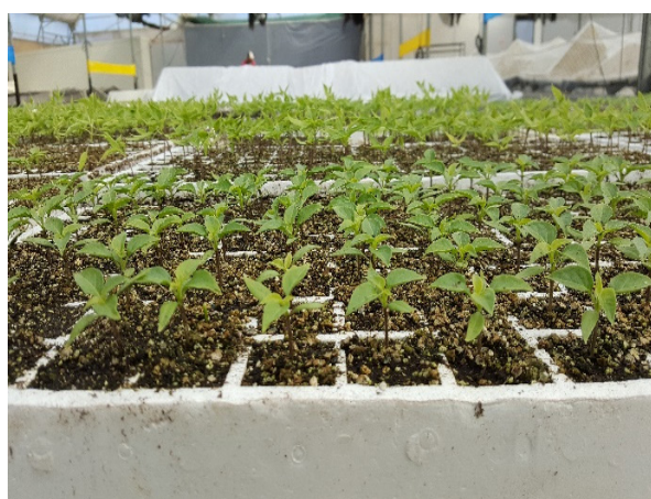
Figure 3 Growth of Habanero pepper seedlings ( Capsicum chinense Jacq.) In the commercial production system in San Quintín, B.C.

(Figure 4), which it is a good beginning for the planting of Habanero peppers. 11 they conducted an investigation on Gibberelic acid and seed germination of Jaltomata procumbens (Cav.) J. L. Gentry, evaluated six concentrations of gibberellic acid (0; 50; 100; 150; 200 and 250 mg/l) and two soaking times (12 and 24 hours), generating a total of 12 treatments, each one was repeated three times, which totaled 36 experimental units and each one with 50 seeds. The treatments were sown in germinating trays, with moss and perlite substrate (1:1), according to the results, treatments of 250 mg/l of Gibberelic acid induced 87% of germination, with 1.7 plants germinated per day over a period of 25.5 days, higher than any other treatment. The time of soaking influences seed germination less than the application of Gibberelic acid.