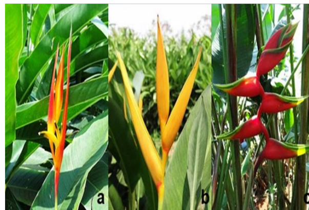
Figure 1 H. densiflora (a), H. psittacorum var. Golden torch (b), H. bihai (Maluca) (c) in semi-shade cultivation. Tangará da Serra – Brasil, 2017.

The accessions of Heliconia densiflora , Heliconia psittacorum var. Golden Torch, and Heliconia bihai (Maluca) (Figure 1) were cultivated in two cultivation systems, fullsun, and semi-shade (30%). The plants were spaced at a distance of 3 × 3 m and irrigation through micro-sprinkling, with one microjet per clump. During planting, fertilization in the pit was carried out with 200 g of formulated N-P-K in the proportion of 3: 1: 2. During the following years, top dressing with 150 g. pit -1 of the formulated N-P-K in the proportion 15:15:15 were carried out every three months. 2