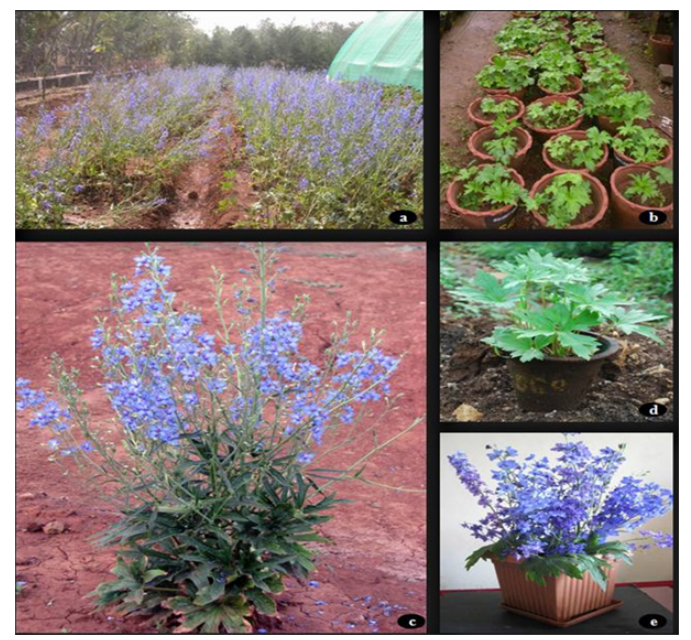
Figure I Delphinium malabaricum (Huth) Munz. (A,B) Cultivation in plots and pots, (C) Habit, (D) Splendid green rosette foliage, (E) Beautiful spikes of Delphinium arranged in a vase.

Seeds collected from various localities were sown in experimental plots and pots (Figure 1A & 1B) at the Department of Botany, Shivaji University, Kolhapur. They were regularly observed for their growth performance and their ornamental potential. Different morphological parameters such as plant height, girth, internodal length, primary and secondary branching as well as number of leaves, scapes, flowers, capsules and seeds per plant and color of flowers were considered for the study. Variations among the flower color in the species were measured with the help of flower color shading chart of the Royal Horticultural Society, London: Flower Council of Holland- Leiden. Height (in cm) and number of scapes / plant of 10 randomly selected plants was considered and average height and average number of scapes / plant was determined. Besides, other preliminary parameters such as soil, growing condition, growing season, crop period and vase life of cut flowers were taken in to consideration.