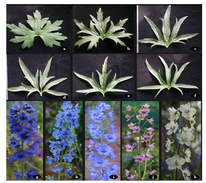
Figure 2 Morphological variations in Delphinium malabaricum (Huth)Munz. a-f: Variation in Leaf shapes; g-k :Variations in flower color.

The short vase life of many cut flowers continues to pose a challenge to the florist industry in general. Flowers are extremely perishable; maintaining their physiological functions very actively