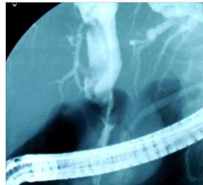
Figure 1 Dilatation of the common hepatic duct.

(Figure 1). After performing a sphincterotomy and using a Dormia basket, a Y shaped cast, reproducing the hepatic ducts confluence, some secondary ducts and the whole main bile duct, was removed (Figure 2). The final patency of the biliary tree was confirmed by passing a balloon (Figure 3). The microscopic analysis of the cast showed that it was composed of amorphous biliary material, without cellular rests.