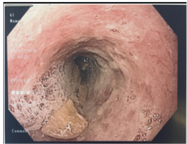
Figure 1 Bullous pemphigoid showing an esophageal stricture.

skin lesions or oropharyngeal involvement. An upper endoscopy was completed, which showed desquamative mucosa at the 25cm mark (Figure 1). There was a large food bolus distal to this, and in attempting to get past the food bolus, an iatrogenic mucosal tear was caused at the 29cm mark (Figure 2). Chest x-ray and CT showed pneumomediastinum without extravasation of contrast. She was taken to the operating room three days later for a repeat upper endoscopy under general anesthesia. The repeat endoscopy showed esophagitis and desquamation at the 23cm mark, a healing perforation site, and although the food bolus had cleared, a stricture was seen at the same site. This was dilated with a 11 mm Savary dilator. Her symptoms resolved after this procedure.