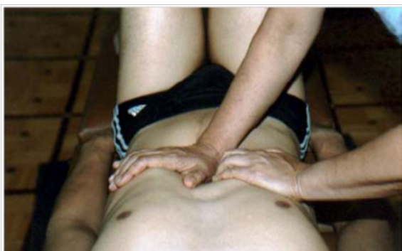
Figure 1 Example of osteopathic maneuver for the esophagus- cardio-tuberosity region.

In March 2014 he was invited to participate in the present research, with osteopathic treatment oriented to GERD. These visits occurred once a week (60 minutes), making 14 consecutive sessions. The Figures 1 & 2 show osteopathic care. The HBQOL (Heartburn Specific Quality of Life Instrument) and QS-GERD (Symptom Questionnaire of Gastroesophageal reflux disease) questionnaires were answered before and after treatment. The patient keeps biweekly appointments until today and intermittent use of pantoprazole with episodes of improvement and recrudescence of cough. He reports improvement in his quality of life with the osteopathic treatment.