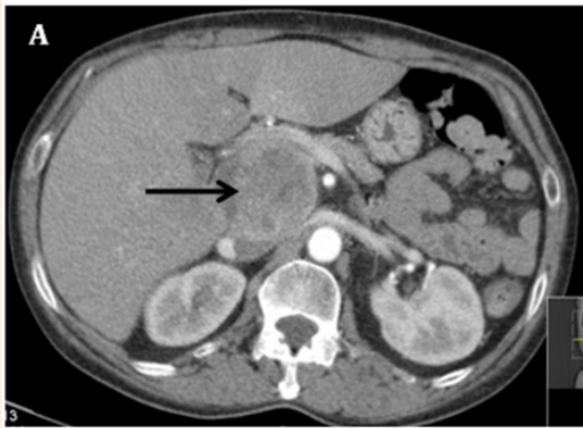
A - transverse view