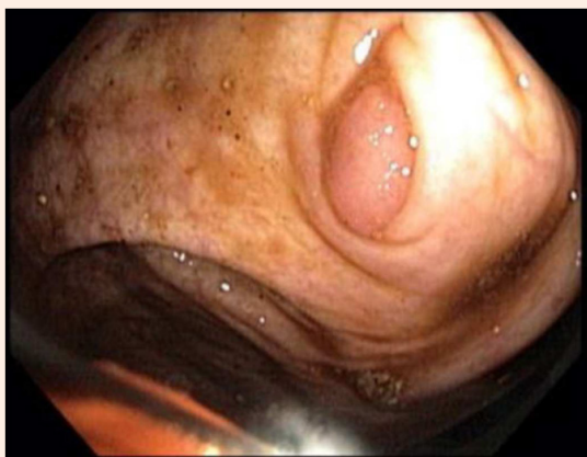
Figure 2: Tubulovillous adenoma within the appendix.

A 57-year-old female with persistent colicky pains in her right upper abdomen after cholecystectomy was referred for colonoscopy to rule out a colonic origin for her complaints. The endoscopist removed several small polyps in the colon and observed a polyp in the appendiceal region, not suitable for endoscopic resection (Figure 2). The polyp was proved to be a tubulovillous adenoma with low-grade dysplasia. Following laparoscopic resection of the base of the cecum histopathological examination showed, in addition to adenomatous polyp, inflammatory changes of the appendix.