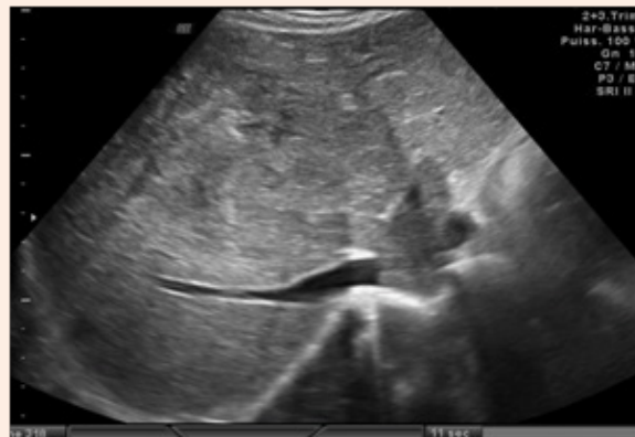
Figure 1: Ultrasound cut through the hepatic veins. The tumor is heterogenous and locates in the segments IV and VIII (yellow arrow). It invaded the median and left hepatic veins and the inferior vena cava (white arrow).

There was hepatomegaly in 70 patients (88.6%). The nodules were noted in 76 cases (96.2%), with an average size of 98.9 mm (range 13 to 223 mm). The distribution of lesions according to the number of nodule and headquartered in CT is noted in Table 2. Early contrast enhancement during the arterial phase, with a washing portal phase was present in 61 cases (77.2%) Figure 2. These aspects were not specified in 16 cases (20.2%). The nodules were hypo-vascular in 2 cases (2.6%). The effusion intraperitoneal was visualized in 30 cases (38%). The presence of a venous invasion was noted in 22 cases (27.8%). Deep adenomegalies were present in 9 cases (11.4%). The alpha-fetoprotein levels were performed in 230 cases (88.1%). The rate was very suggestive in 174 cases (75.7%), reminiscent in 38 cases (16.5%) and negative in 18 cases (7.8%). Histological confirmation was performed in 44 cases (18.8%). Hepatocellular carcinomas (HCC) accounted for the majority of the lesions found in 42 cases (95.5%). Of these lesions, 33 were poorly differentiated, moderately differentiated 4 and 5 well differentiated. We also noted one case of fibro-lamellar carcinoma and 1 case of cholangio carcinoma. The staging had identified 18 cases (8%) of lung metastases (13 cases of 37 chest X-ray front and 5 cases of 7 chest CT).