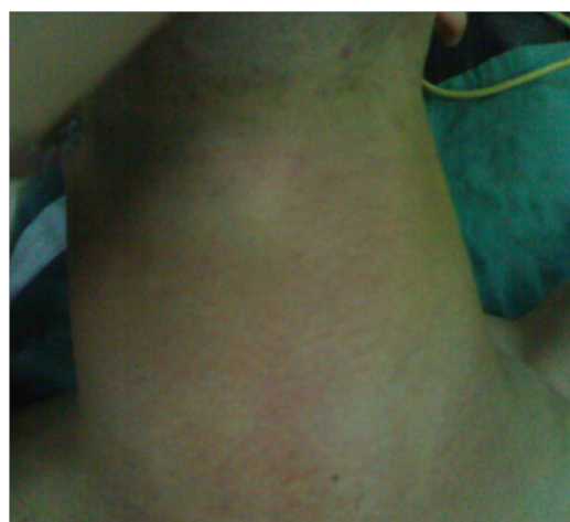
Figure 6 Erythem of neck due to diverticulitis.