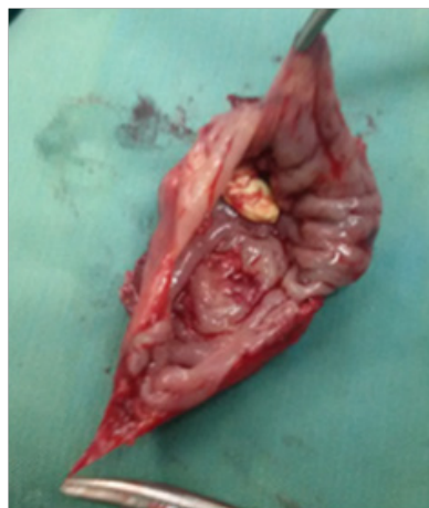
Figure 10 Show swallow debris in the pouch of huge Zenker's diverticulum.