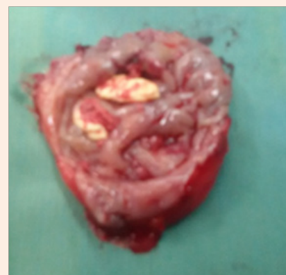
Figure 11: A typical barium swallow demonstrating a cervical (Zenker's) diverticulum.