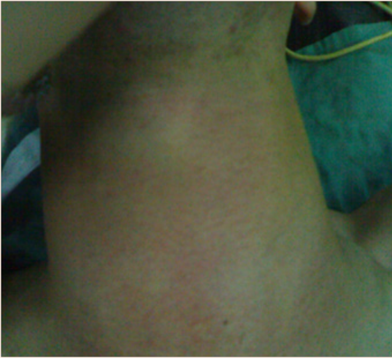
Figure 6: Erythem of neck due to diverticulitis.