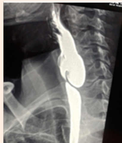
Figure 4: Show swallow of a 80 year old man with huge Zenker's diverticulum.