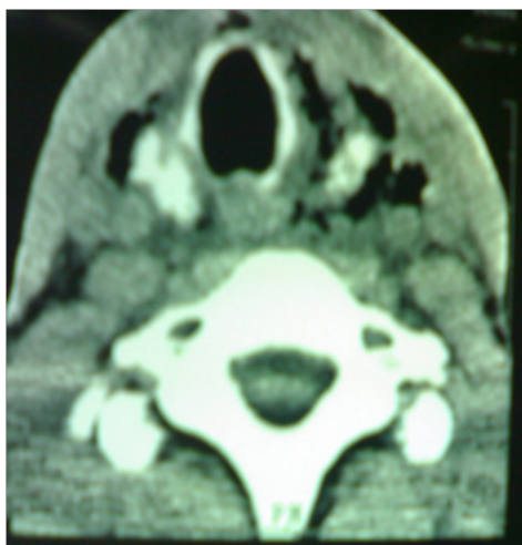
Figure 7 CT-scan of neck with subcutaneous Emphsema.