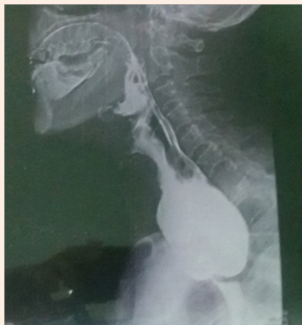
Figure 1: Show swallow of a 75 year old man with huge Zenker's diverticulum.

and regurgitation, one of this patient present three period with aspiration pneumonia and hospital admission. One of patients underwent endoscopic diverticulotomy and 24 hour after this procedure present with odynophagia, fever and neck subcutaneous emphysema With B-swallow perforation of diverticula was demonstrated, this patient underwent neck exploration and diverticulectomy and drainage. Diagnostic tools of five cases was B-swallow and esophagoscopy (Figure 1-5). One came with food marital retention and pain and neck mass tender mass. One patients referred with erithem, redness and criptation of neck with diagnosis of diverticulitis (Figure 6 & 7). Two cases underwent flexible endoscopic diverticulotomy, one failed and another ones complicated with perforation. The most common surgical approaches was diverticulectomy and myotomy in four patients (Figures 8 & 9). Food debris was present in one patient (Figure 10). Two of patients underwent diverticulectomy without myotomy. Complication and mortalities were zero. In two years flow-up, Outcome was good.