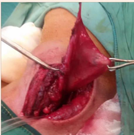
Figure 8: Show swallow pouch of huge Zenker's diverticulum after opening.