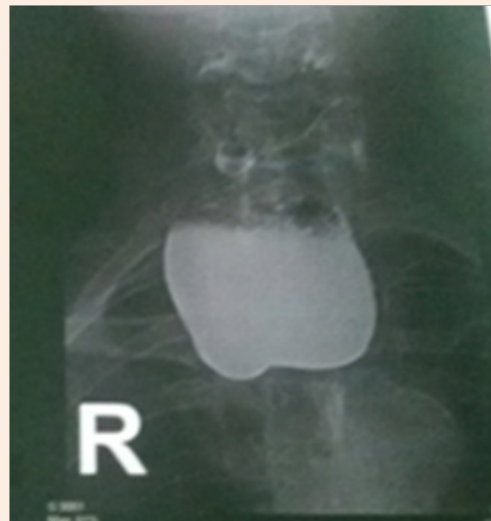
Figure 3: Show swallow of a 65 year old man with huge Zenker's diverticulum.