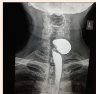
Figure 5: Show swallow of a 78 year old man with huge Zenker's diverticulum.