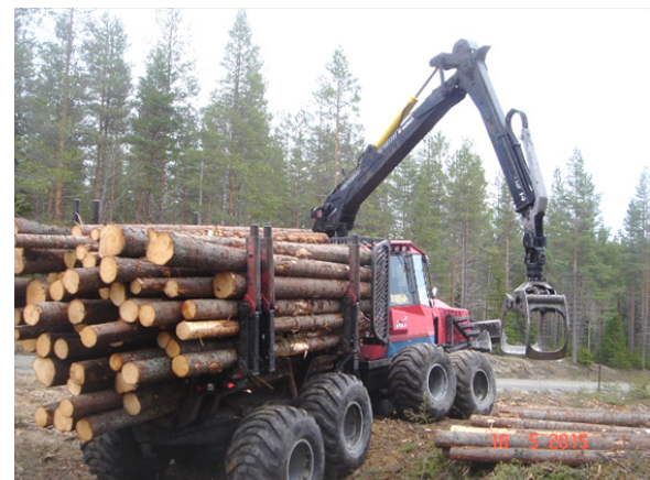
Figure 1 The test vehicle, Valmet 890.2 with load but no bogie tracks.

gravity. To load the machine 15tonnes of timber was prepared the day before using the built in scales in the banks ( \pm 10 kg) (Figure 1).