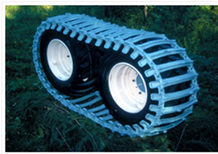
Figure 2 EcoTracks bogie band from Olofsfors.