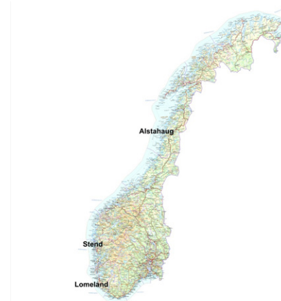
Figure 1 Location of the research areas in Norway applied in this study. Alstahaug, Stend and Lomeland.

For quantifying gains or losses in biomass production connected to the choice of tree species, we analyzed absolute and relative difference between neighboring stands with similar growth conditions. An identical approach has previously been used for growth comparisons of silvicultural systems, tree species and provenance choices. 23–25 From the forest trial revision bank managed by the Norwegian Forest Research Institute (NIBIO) we selected and utilized growth and yield data from long-term plots located in afforestation districts. Three research forests in coastal Norway covering trials of native and non-native species and stand ages mainly above 70 years was chosen for this case study; Alstahaug in Nordland County, Stend in Hordaland County and Lomeland in Rogaland County (Figure 1).