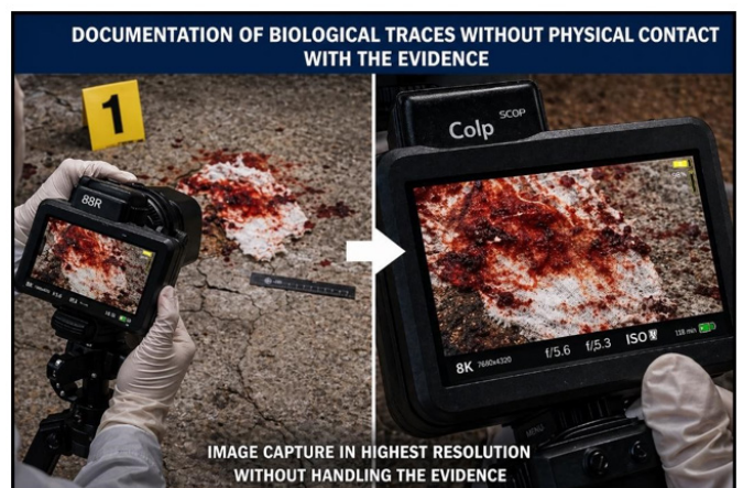
Figure 5 Non-contact documentation of biological evidence.