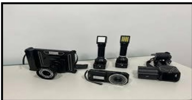
Figure 1 8K image acquisition system employed at a homicide scene.

In fingerprint analysis, green illumination was frequently observed to provide better performance in revealing latent prints, whereas white light demonstrated good versatility across different surfaces (Figures 1–5).