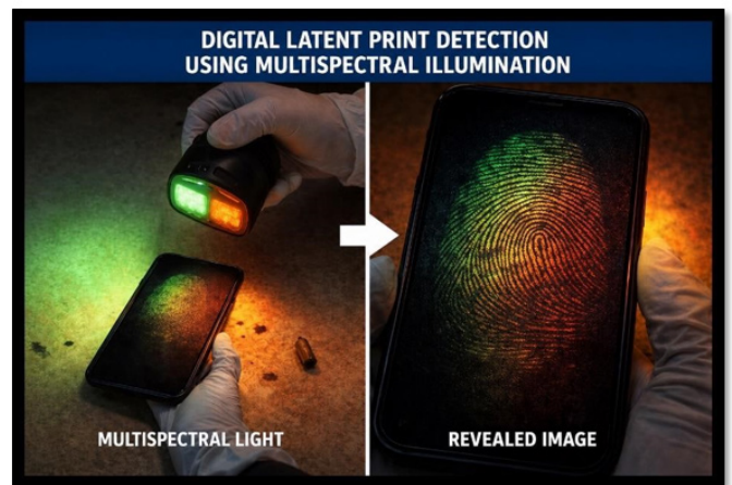
Figure 3 Latent fingerprint detection using multispectral illumination.