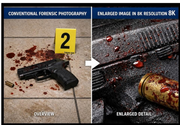
Figure 2 Comparison between conventional forensic photography and a magnified image in 8K resolution.