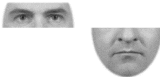
Figure 3 Example

Materials: Facial composites were manipulated with Adobe Photoshop by highlighting and expurgating external features, resulting in internal-only composites. These were then separated in the middle of the nose, creating two sets of stimuli: one showing upper internal features, and one showing lower internal features (Figure 3). Target photographs and composites were printed in greyscale (8 cm x 10 cm).