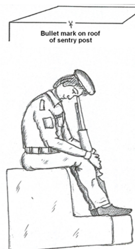
Figure 6 Possible position of the rifleman (shooter) reconstructed based on crime spot analysis & wound ballistics.

The viscera analysis ruled out the presence of common poison/ alcohol (Figure 6).