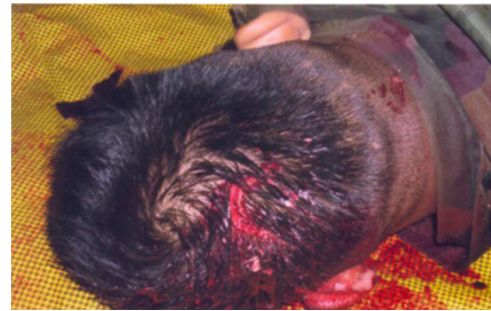
Figure 4 Entry wound on the back side as per autopsy report.