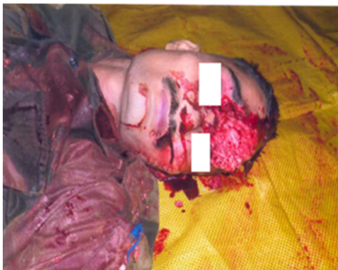
Figure 3 Exit wound on the forehead as per autopsy report.