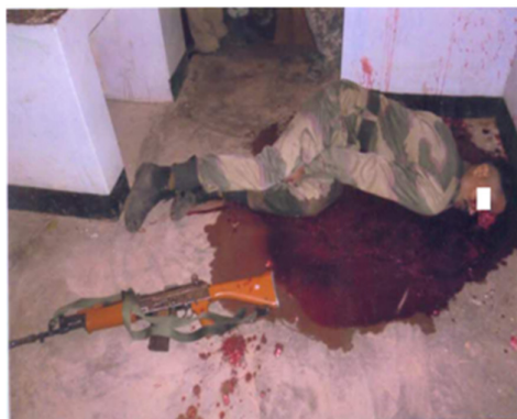
Figure 2 Deceased lying in a pool of blood with service firearm and fired cartridge case.