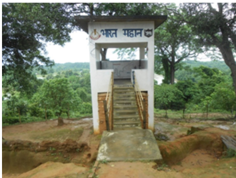
Figure 1 Sentry post located near international border.

side was remote. Further, analysis of the photograph of exit wound (as per autopsy report) it was seen that the bullet injury is devastating and could cause when firing was made at the contact of hard skull. On contact or near contact firing range, the gas/flame produced by the combustion of the propellant could produce fatal injuries more than the injury by bullet. The skull being hard could not expand due to inadequate space for expansion of gas. As a result, large quantities of gas entering into the skull rebounded back and escaped through entry wound pulling out the soft brain matter. 4 On spot analysis, it was found that one bullet mark was present on the roof of sentry post at acute angle with respect to the sitting position (cemented platform) of security personal. The position of bullet mark/dead body just after incident was suggestive of the muzzle end of rifle in upward direction (Figures 1–5).