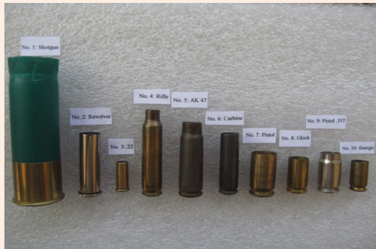
Figure 1: A side view of the ten types of fired casings associated with the 102 mass shooting incidents.