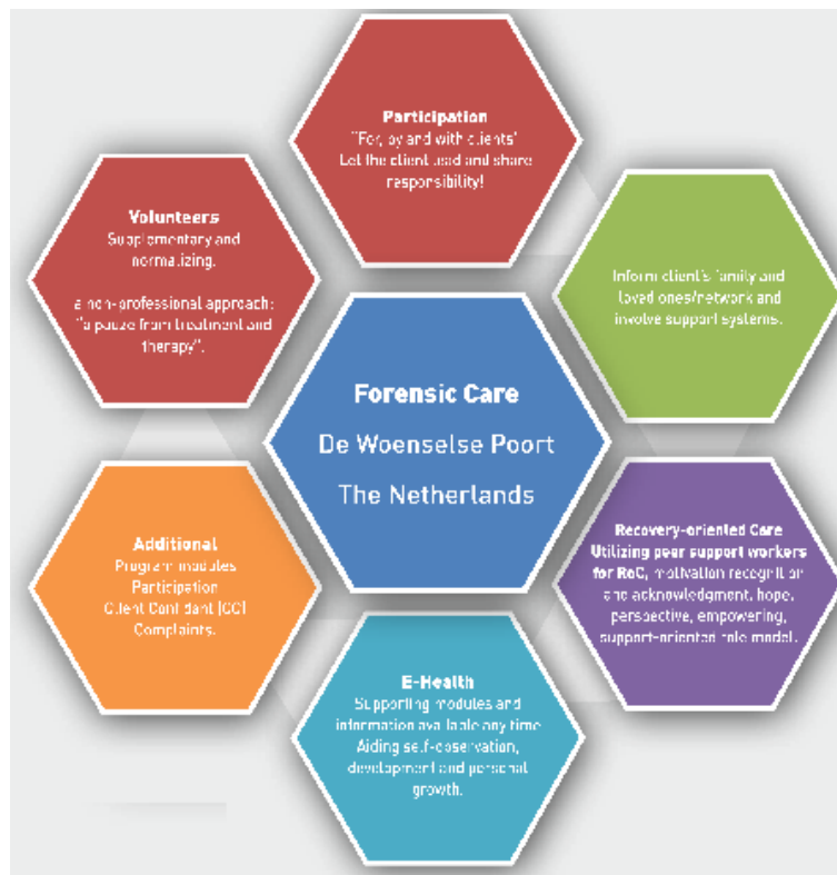
Figure 1 Schematic diagram of Client participation in forensic care.

Received: June 23, 2016 | Published: July 7, 2016