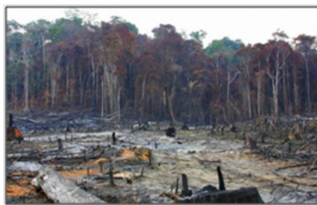
Figure 4 Image showing the deforestation occurring due to coca plantations. 23

jaguars that live in the Amazon are becoming extinct as their habitat is being destroyed (Figures 4 & 5). 22,23