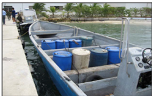
Figure 9 Image of a small boat used for shipping cocaine out of South America. 17

for shipping the precursor chemicals needed back to South America for production. 12 Cocaine arrives in Europe by trafficking through Africa and there are routes through Spain and Portugal 6 these routes still exist today, the Netherlands are the main hub in Europe and from here cocaine is transported to the United Kingdom by a variety of means. There are many different methods of trafficking including by sea either on fast boats or bigger ships, by air on small aircrafts and by land crossing borders. No matter which method is chosen, the aim remains the same that the drug barons are trying to beat the customs 10 and maximise the amount of cocaine that reaches the destination. Figure 9 shows a small boat that is used for shipping cocaine.