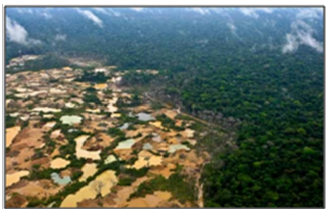
Figure 5 Image showing the deforestation of the Amazon Rainforest for coca plantations. 23

The production of cocaine can differ greatly from large scale productions in clandestine laboratories to small scale productions in jungle huts. 8 However, the method of production remains the same and always takes place in hidden secretive areas covered by trees to prevent being caught as seen in Figure 6.