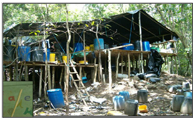
Figure 6 Image showing a typical coca leaf processing plant in the middle of the Colombian jungle. 17

The production of cocaine can differ greatly from large scale productions in clandestine laboratories to small scale productions in jungle huts. 8 However, the method of production remains the same and always takes place in hidden secretive areas covered by trees to prevent being caught as seen in Figure 6.