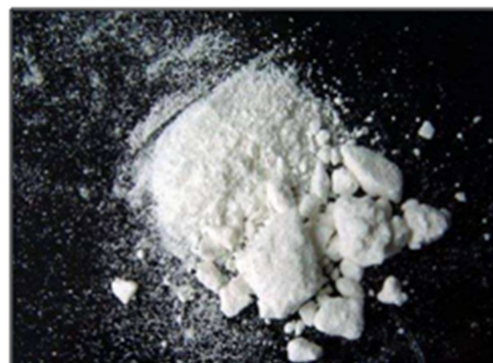
Figure 1 Image to show the appearance of powder cocaine. 15

preferred to snorting cocaine because the effects are more rapid as the freebase crack melts and vaporises under flame 14 and the vapour is inhaled causing immediate effect on the brain. For cocaine addicts, one of the most important things is the sudden rush and speed of onset so as smoking crack is the fastest method to feel the effects, this is considered the best choice to drug abusers. 6