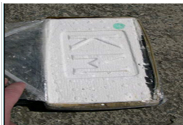
Figure 8 Image showing the logos imprinted on cocaine blocks. 17

Although those that are involved in the production of cocaine in the jungles of Colombia, Bolivia and Peru do not earn good money, it is the best option and income that they will ever be offered in their lifetime [8] and this means that they would rather be in the trade even with the health risks, risk of being killed by others higher up in the chain and the risk of imprisonment. 7 Having studied the production of cocaine it is clear that the main producers are Colombia, Bolivia and Peru and then the cocaine is trafficked and distributed around the world. The method is not simple or fast but the income makes it worthwhile to everyone involved whether in the jungle treading on the leaves to the person living in the mansion just collecting the money at the end. Cocaine production is on a massive scale with hundreds of thousands of hectares of land being used for coca plantation and this is just the beginning of an international drug trade.