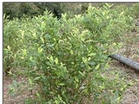
Figure 3 Image of a coca plant. 17

The street slang is a part of the dealing process for gangs because they use it as code for what they are really selling. Cocaine has names such as 'snow' and 'dust' because of its powder form and crack is often called 'rocks' and 'teeth' because of its appearance. Other names that are also well-known are 'Charlie', 'white lady' and 'coke' 10,17 (Figure 3).