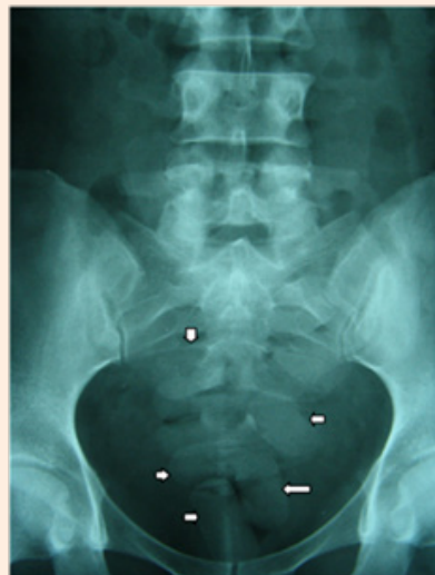
Figure 10: Image showing the pellets of cocaine inside a body packer [26].

through customs. Cocaine is the most common drug involved in body stuffing [25] and it poses serious risk to the drug mules [26]. Figure 10 shows the cocaine pellets that have been swallowed by a body packer. There can be up to two kilograms of cocaine swallowed in pellets at one time and lubricant jelly and tubes down the throat are used to aid the process. Although the medical risks are serious there is also the risk of imprisonment but this is not enough to stop the drug traffickers because their income takes priority over the extreme risks and they have to do this in order to make a living.