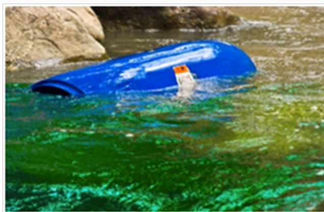
Figure 7 Image showing the waste being poured into the rivers. 17

This image shows the conditions of the jungle laboratories; they are dirty, unstable with a shanty structure and the equipment used is not sterile. The process begins with extracting the cocaine from the coca leaves by making coca paste. 10 This is done by using bleach, kerosene and sulphuric acid so that the leaves soften and are made into paste. In the jungles where it all takes place, the people use their feet to crush the leaves and this is dangerous because the chemicals used are strong and acids burn. The next step is to filter the solution and skim the kerosene containing the coca alkaloid off, and all the rest is waste. This waste is poured into the rivers, as seen in (Figure 7), which causes water pollution which is bad for the environment and the animals of the ocean. 21 The remaining toxic solution is strained and the residue goes to a laboratory where hydrochloride salt is added (use hydrochloric acid) which makes powder cocaine. 6 To make crack cocaine which is the freebase form, powder cocaine is heated with baking powder. 16 The refinery of cocaine often takes place at the home of a cartel (boss in the drug business) and logos are imprinted on the blocks of cocaine as shown in Figure 8.