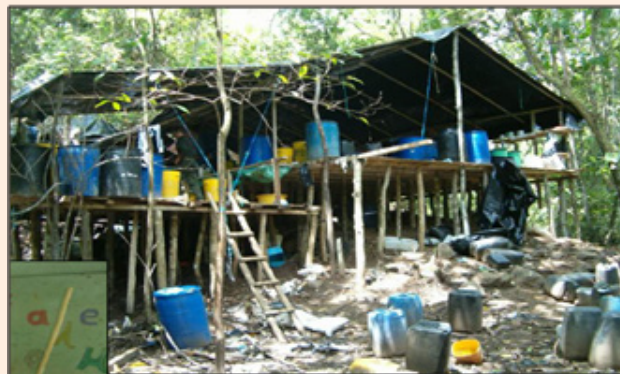
Figure 6: Image showing a typical coca leaf processing plant in the middle of the Colombian jungle [17].

which is the freebase form, powder cocaine is heated with baking powder [16]. The refinery of cocaine often takes place at the home of a cartel (boss in the drug business) and logos are imprinted on the blocks of cocaine as shown in Figure 8.