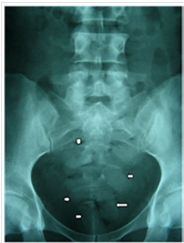
Figure 10 Image showing the pellets of cocaine inside a body packer. 26

There are so many of these sent out that if a few don't make it, there is no consequence to the drug barons because they make such a vast profit that such a loss is worthless. The methods above are for cargos of larger amounts of cocaine but there are other methods where the cocaine is concealed and trafficked in smaller amounts. Common methods are body stuffing and packing 24 where drug mules are used to traffic cocaine through customs. Cocaine is the most common drug involved in body stuffing 25 and it poses serious risk to the drug mules. 26 Figure 10 shows the cocaine pellets that have been swallowed by a body packer.