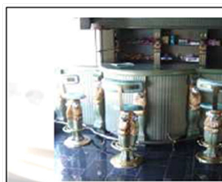
Figure 11 Gold plated stools at a cartel's home. 17

The cutting of cocaine increases profit because it allows more doses to be made 28 by using less of the illicit drug. Each time the cocaine comes into contact with a new dealer it is re-bulked and so the end purity has decreased from about 80-90% pure at production to between 10-20% pure at street level sale but the price has increased massively as is shown in Table 2 ( Appendix I ). Figure 11 shows furniture that was found at a cartel's home and part of the stools are gold plated.